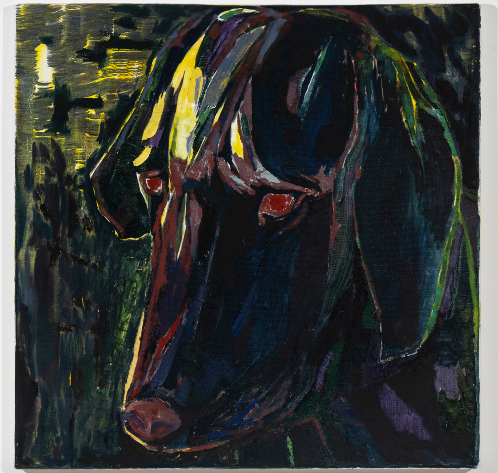
Black Dog, 2024 oil on canvas 60 x 60 cm £ 3,250