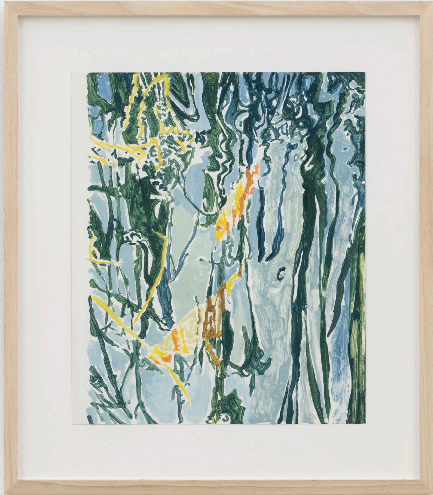
Golmund II , 2024 oil on gloss 26 x 32 cm 36 x 42 cm Framed £ 950