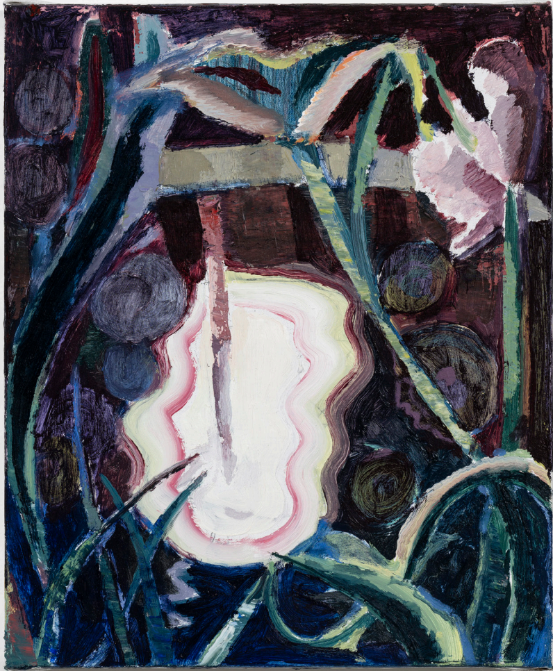
Verge II , 2024 oil on canvas 26 x 32 cm £ 1,400