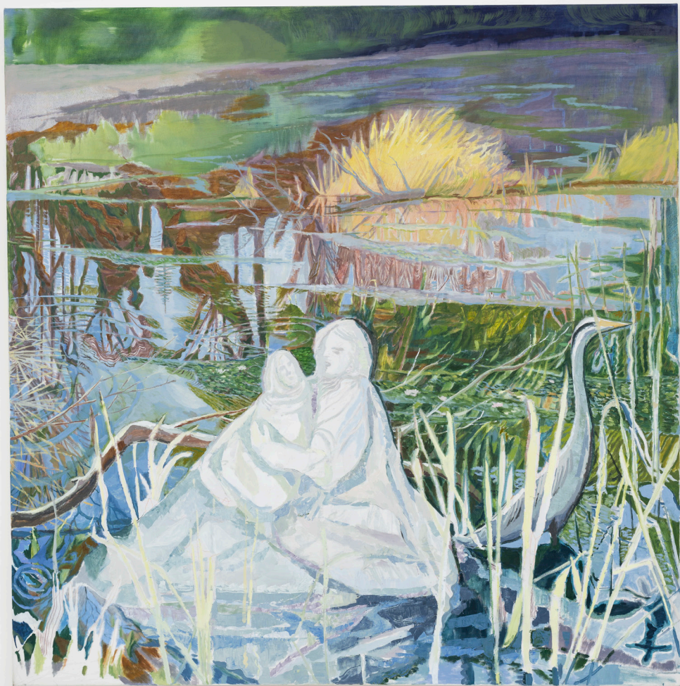
Pond (post anthropocene) AD, 2024 oil on canvas 150 x 150 cm £ 7,000