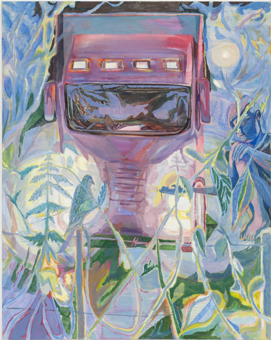
Hawk in the Headlights , 2024 oil on canvas 120 x 150 cm £ 6,500