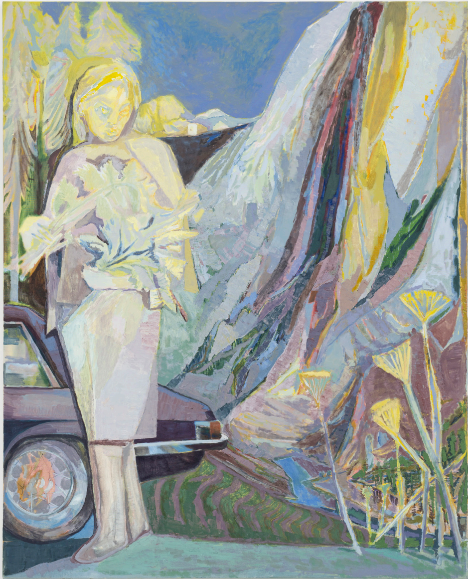
Roadside Bouquet , 2024 oil on canvas 120 x 150 cm £ 6,500