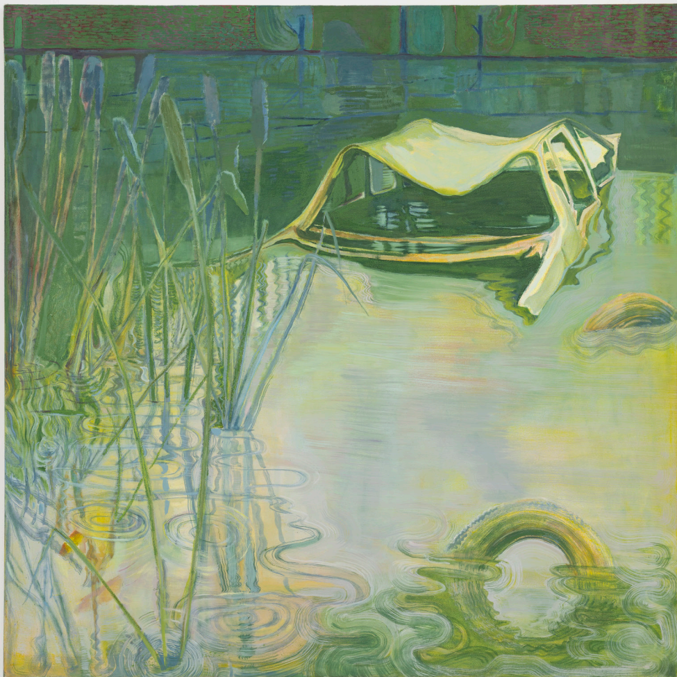
Haiku , 2024 oil on canvas 150 x 150 cm £ 7,000