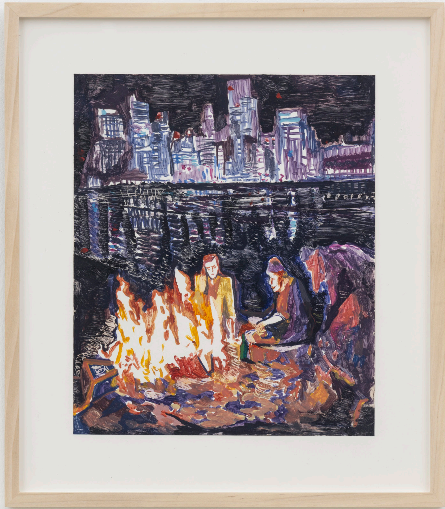
Limehouse, 2024 oil on gloss 26 x 32 cm 36 x 42 cm Framed £ 950