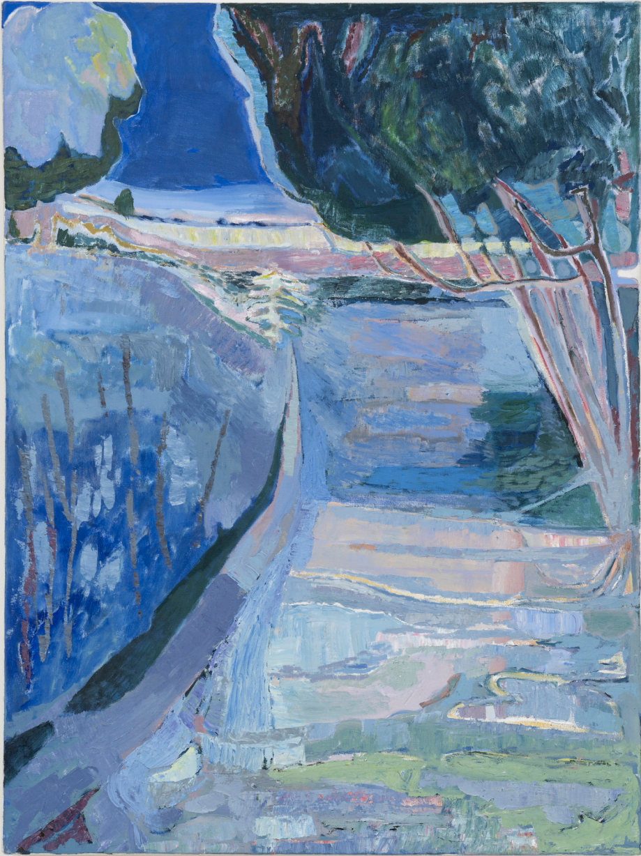
Ditch , 2024 oil on canvas 120 x 90 cm £ 4,500