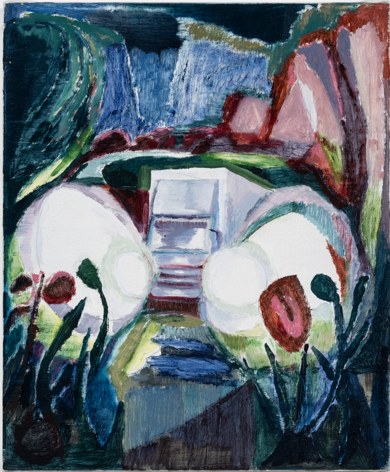
Full beam , 2024 oil on canvas 26 x 32 cm £1,400