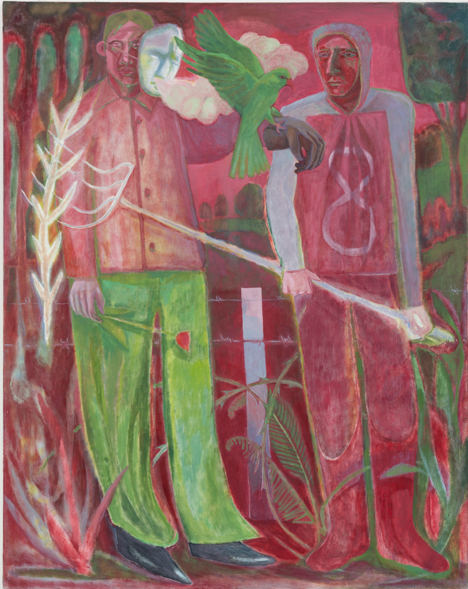
Tough Love , 2024 oil on canvas 120 x 150 cm £ 6,500