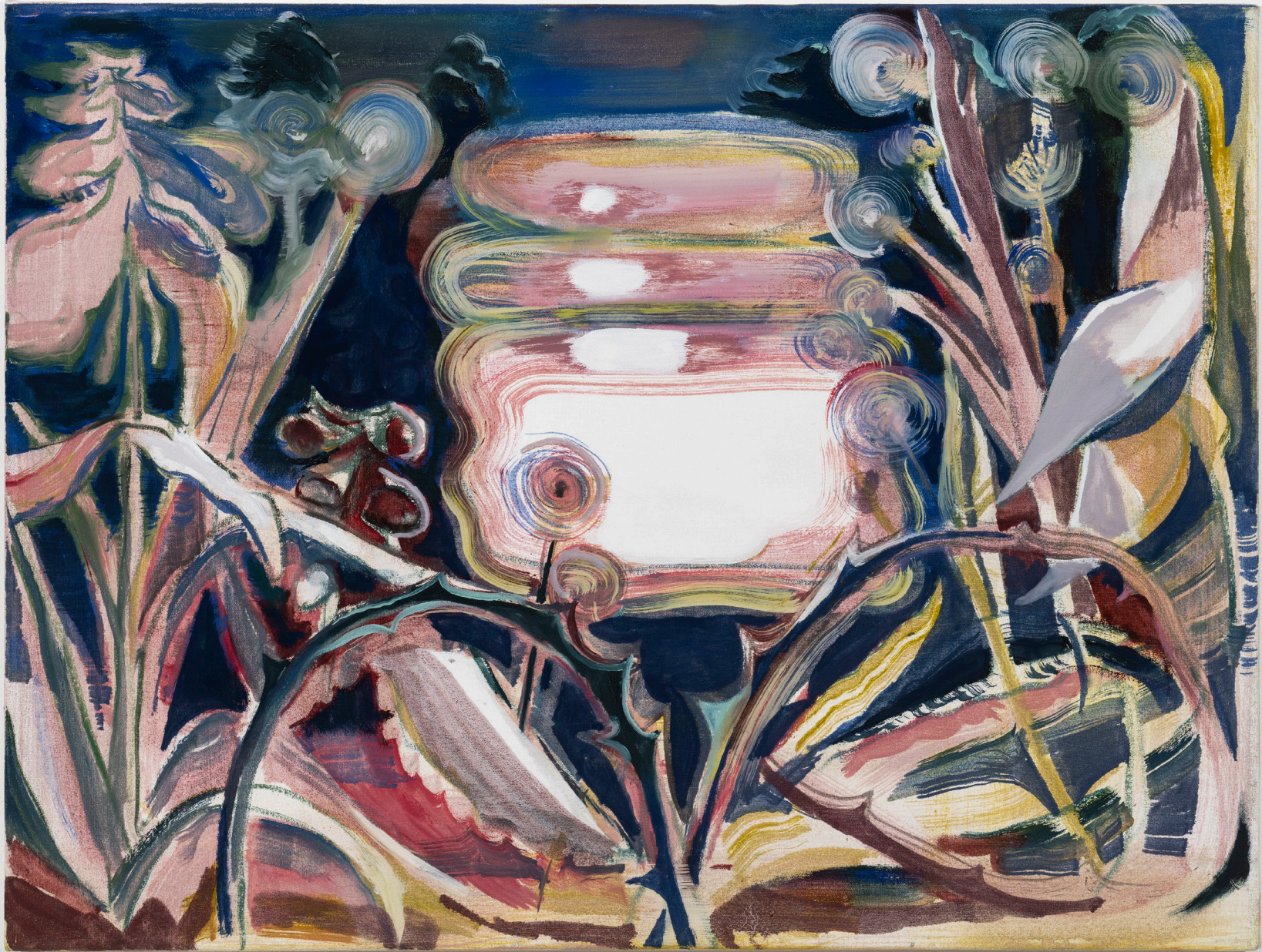
Full beam II , 2023, oil on canvas, 61 x 76 cm, £3,500