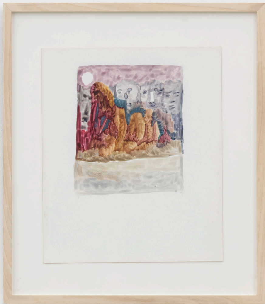
Grey Face , 2024 oil on gloss 26 x 32 cm 36 x 42 cm Framed £ 950