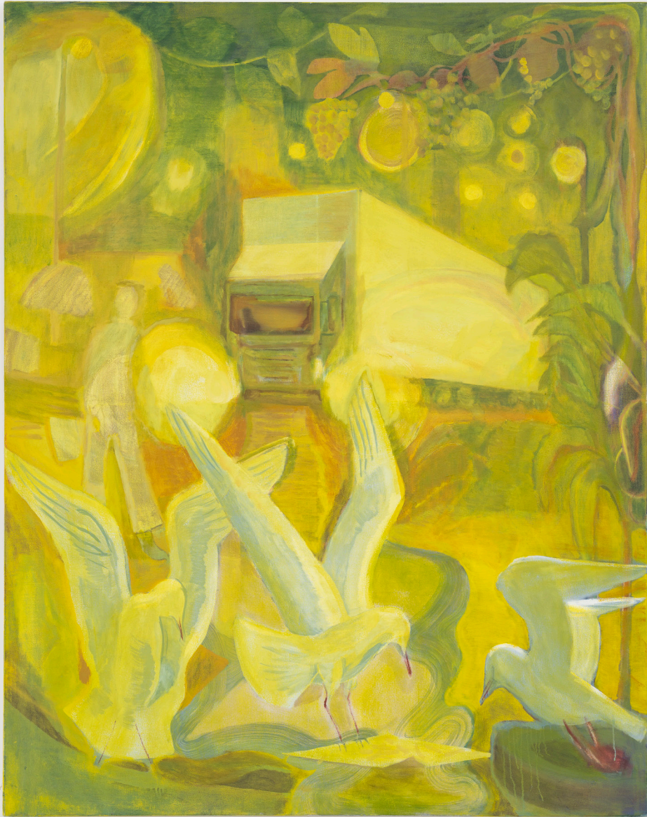
A heap of broken images , 2024 oil on canvas 120 x 150 cm £ 6,500