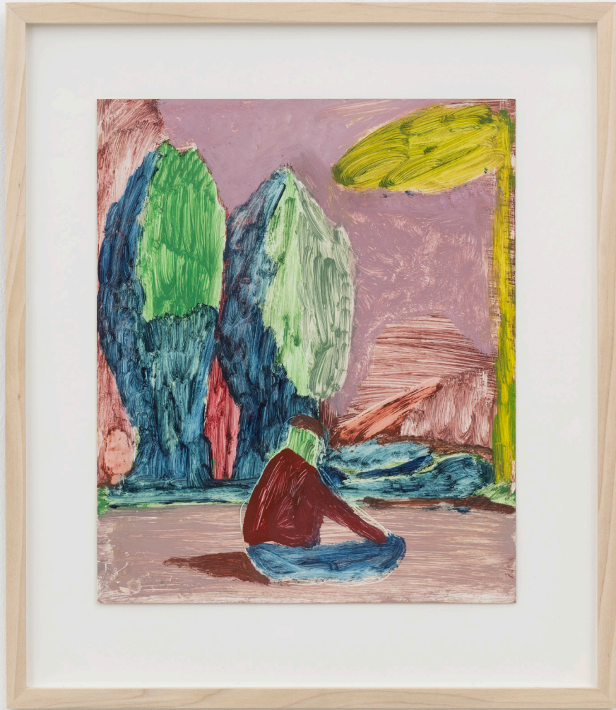
Untitled, 2024 oil on glass 26 x 32 cm 36 x 42 cm Framed £ 950