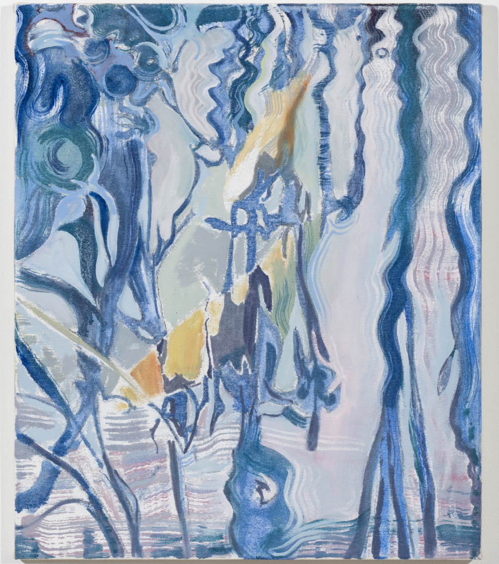
Goldmund , 2024 oil on canvas 61 x 51 cm £ 3,250