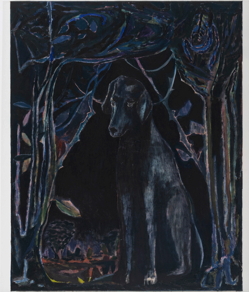
Black Dog II , 2024 oil on canvas 80 x 100 cm £ 4,250