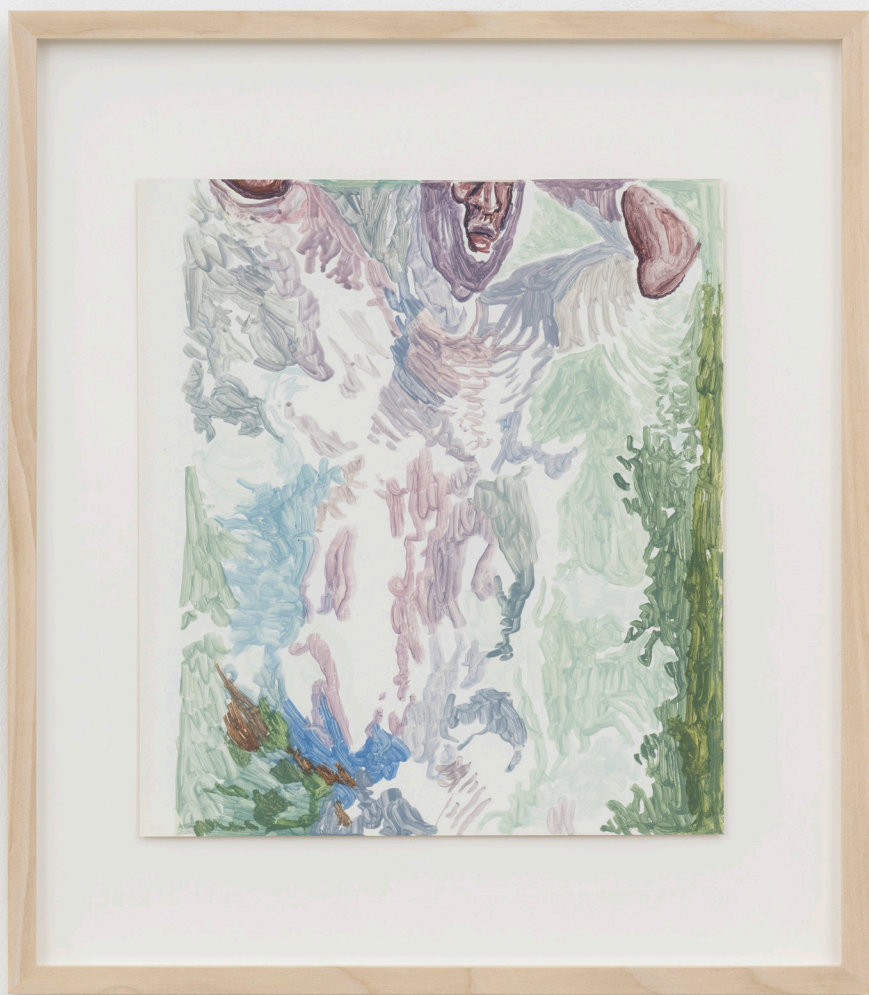
Yaron , 2024 oil on glass 26 x 32 cm 36 x 42 cm Framed £ 950