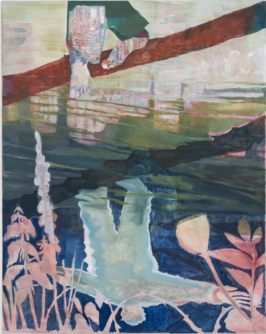
The Crossing II , 2024 oil on canvas 152 x 122 cm £ 6,500