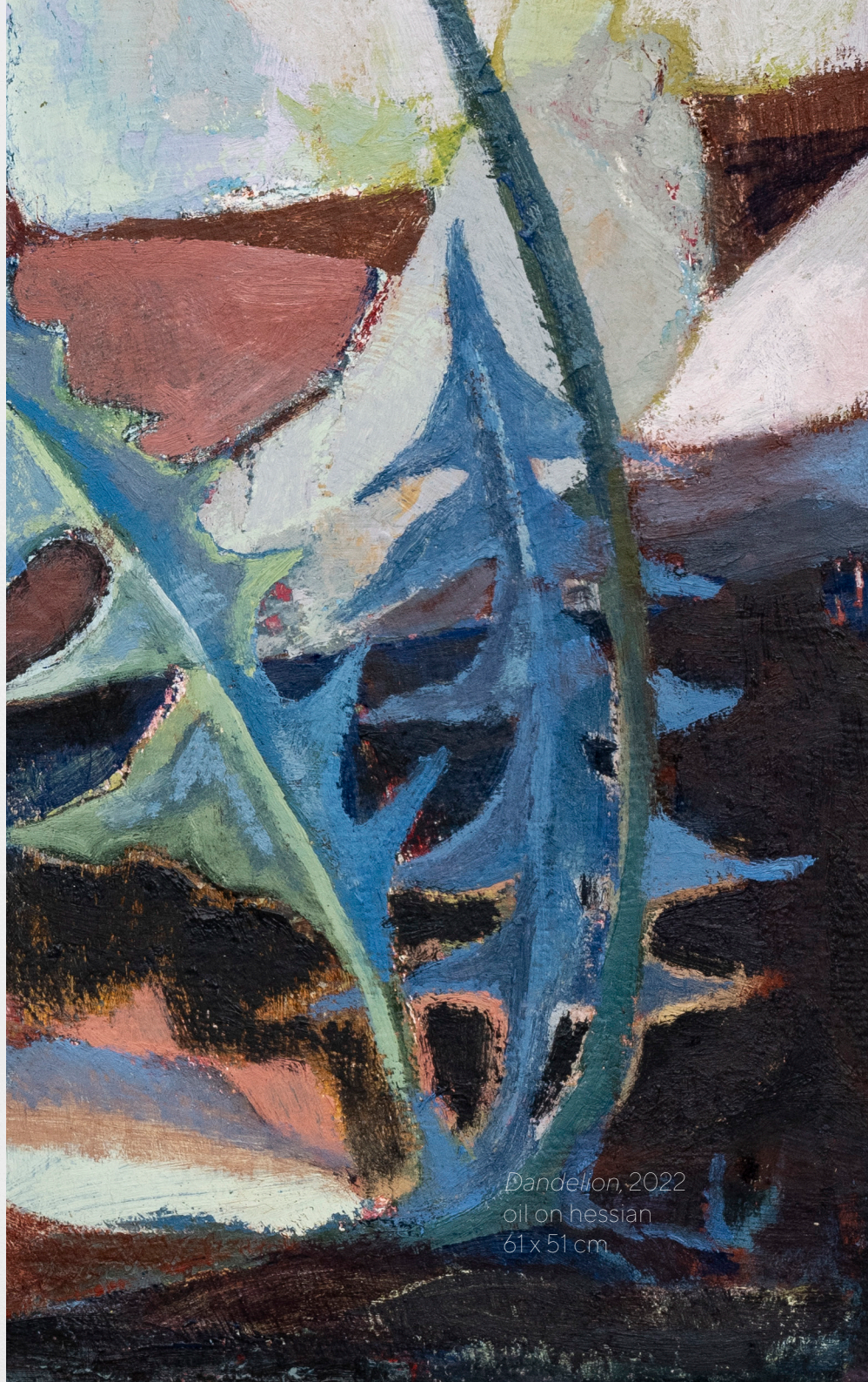
Dandelion, 2022 oil on hessian 61 x 51 cm