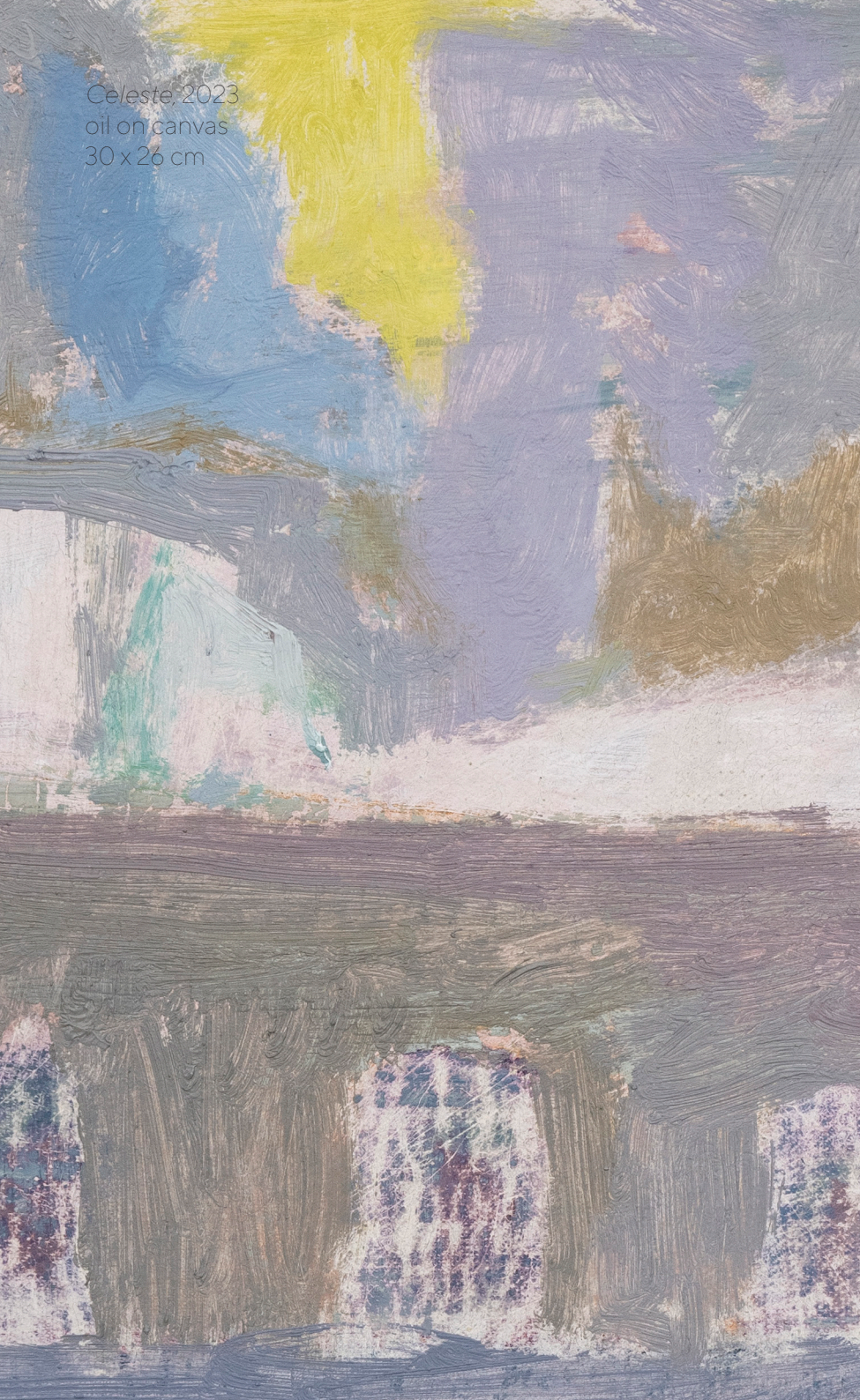
Celeste, 2023 oil on canvas 30 x 26 cm