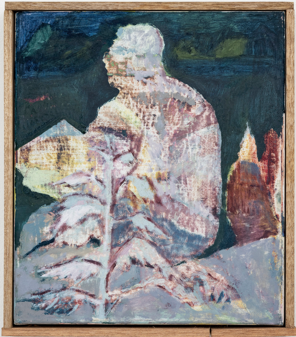
Untitled (figure reading), 2023 oil on canvas 30 x 26 cm