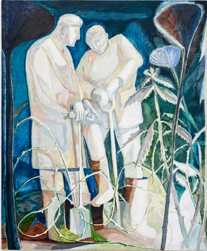
Demiurge , 2022-23 oil on canvas 183 x 160 cm