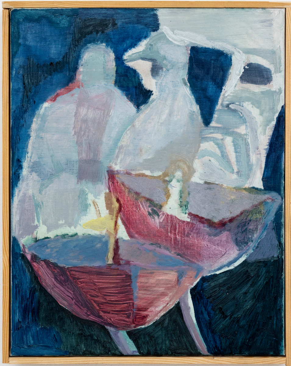
Flowers, 2023 oil on canvas 30 x 26 cm