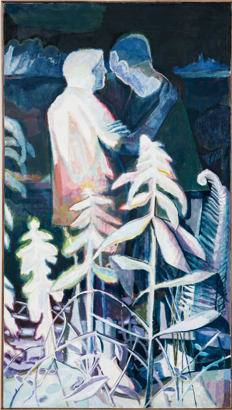
Blue Crystal Fire, 2022 oil on canvas 180 x 100 cm