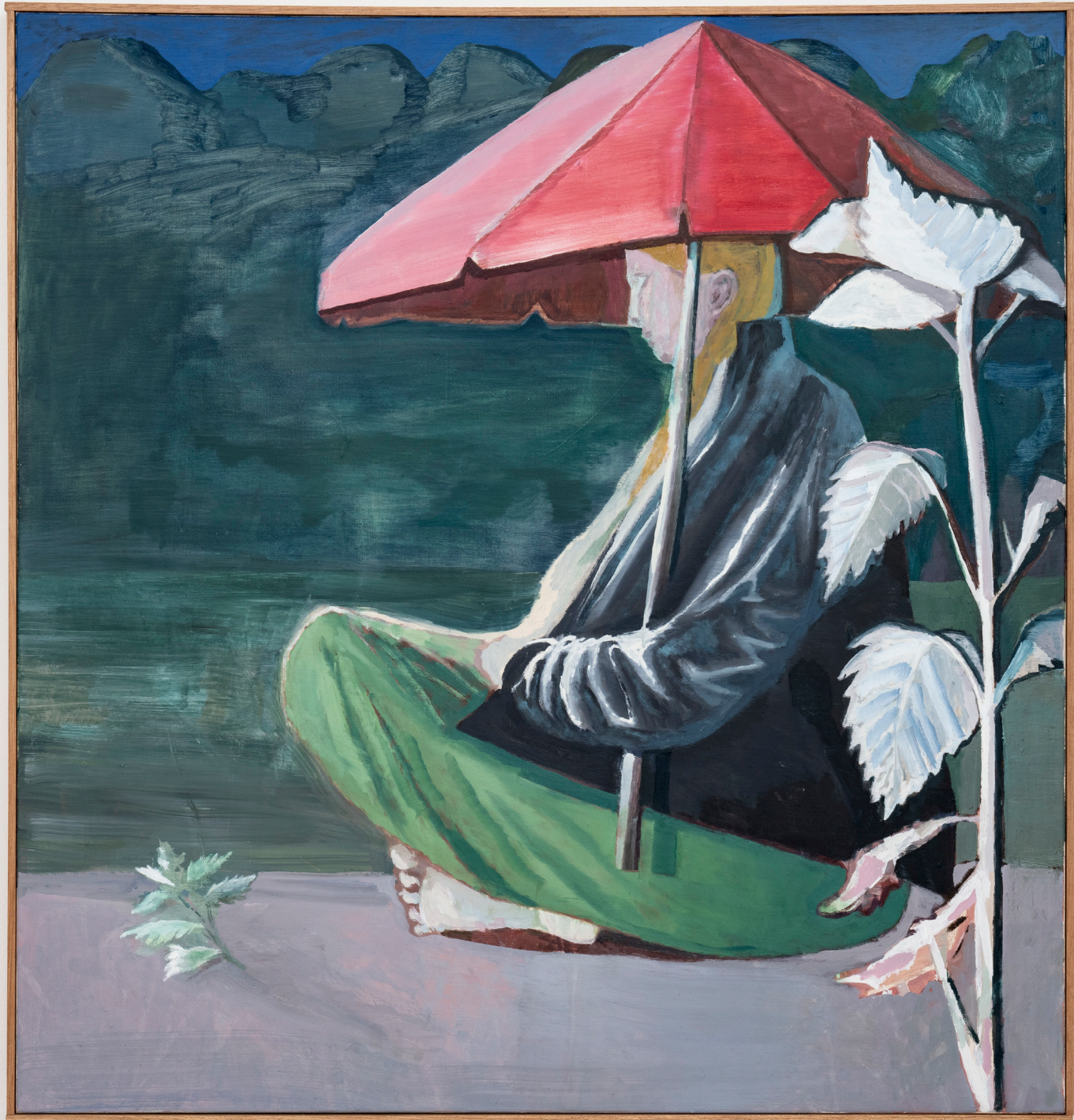
Parasol , 2023 oil on canvas 112 x 107 cm £ 6,000