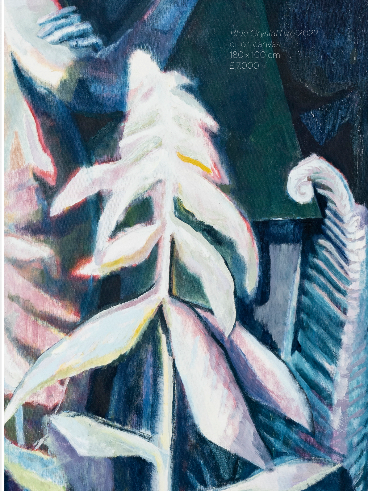
Blue Crystal Fire , 2022 oil on canvas 180 x 100 cm £7,000