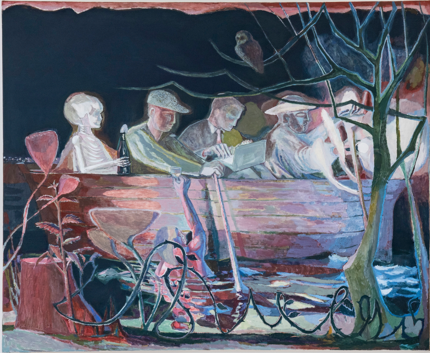
Ship of Fools , 2022-23 oil on canvas 160 x 180 cm £ 8,000