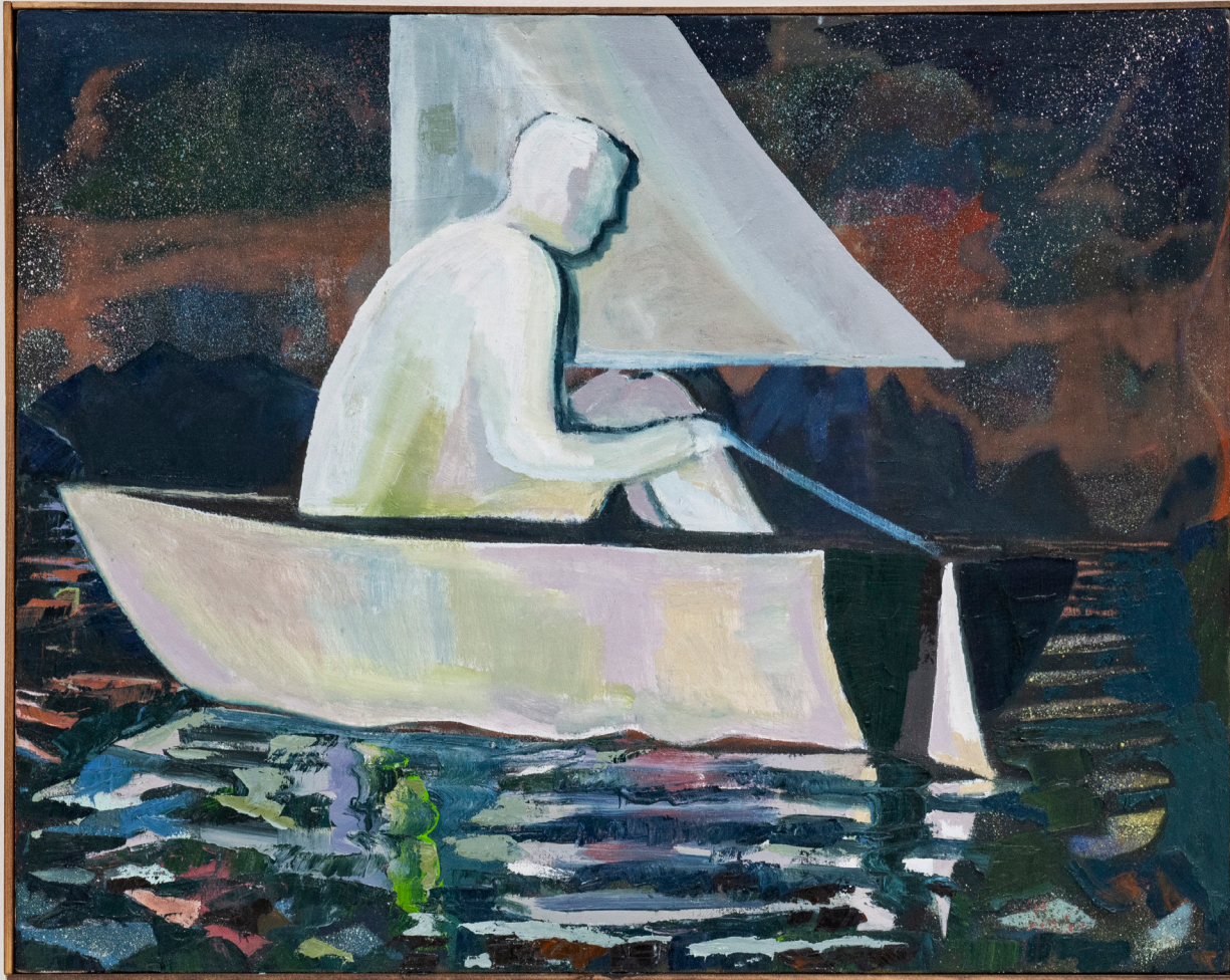
Laser , 2023 oil on canvas 60 x 85 cm £ 3,600