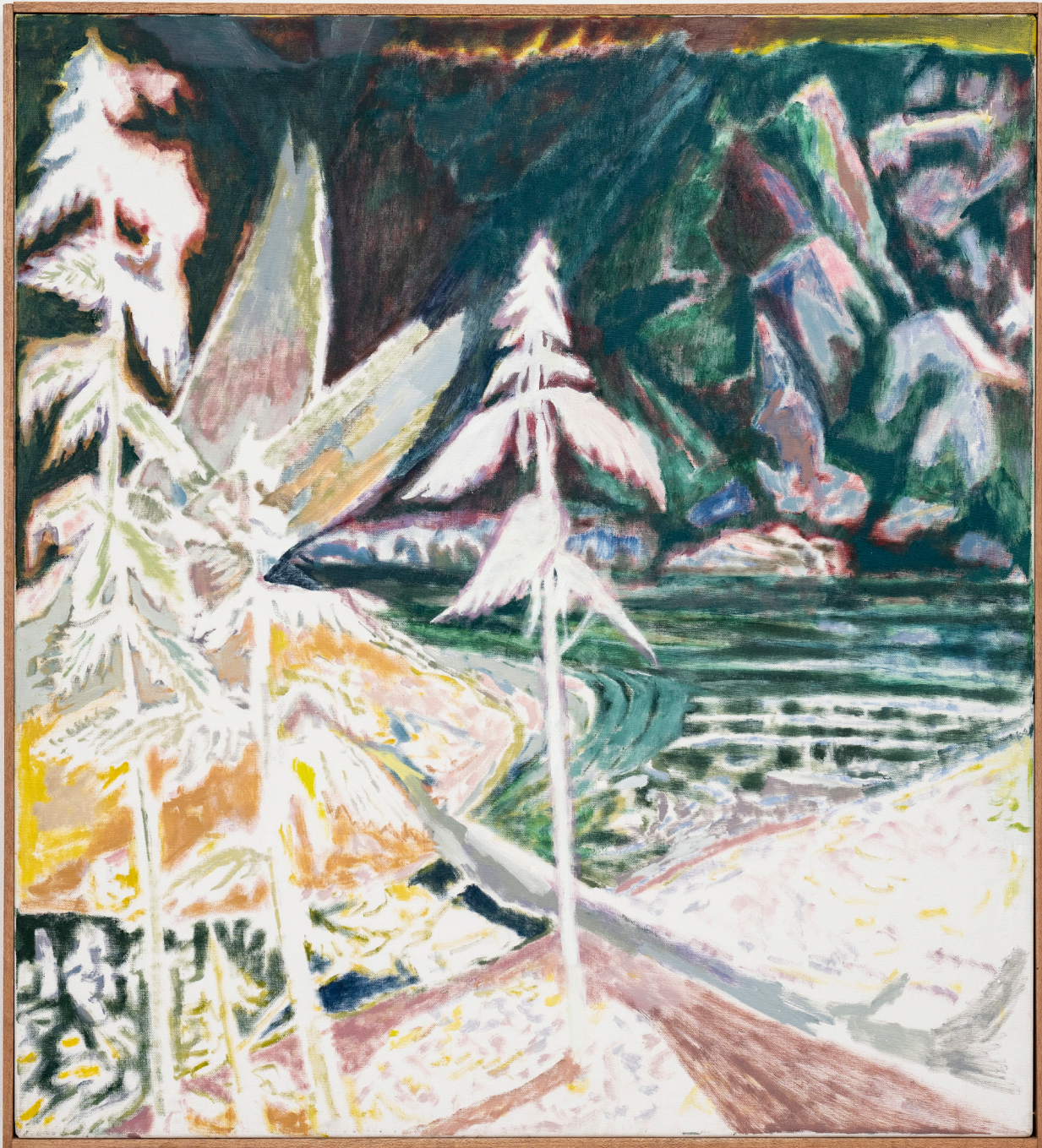
Riverbank, 2023 oil on canvas 86 x 81 cm £ 4,000