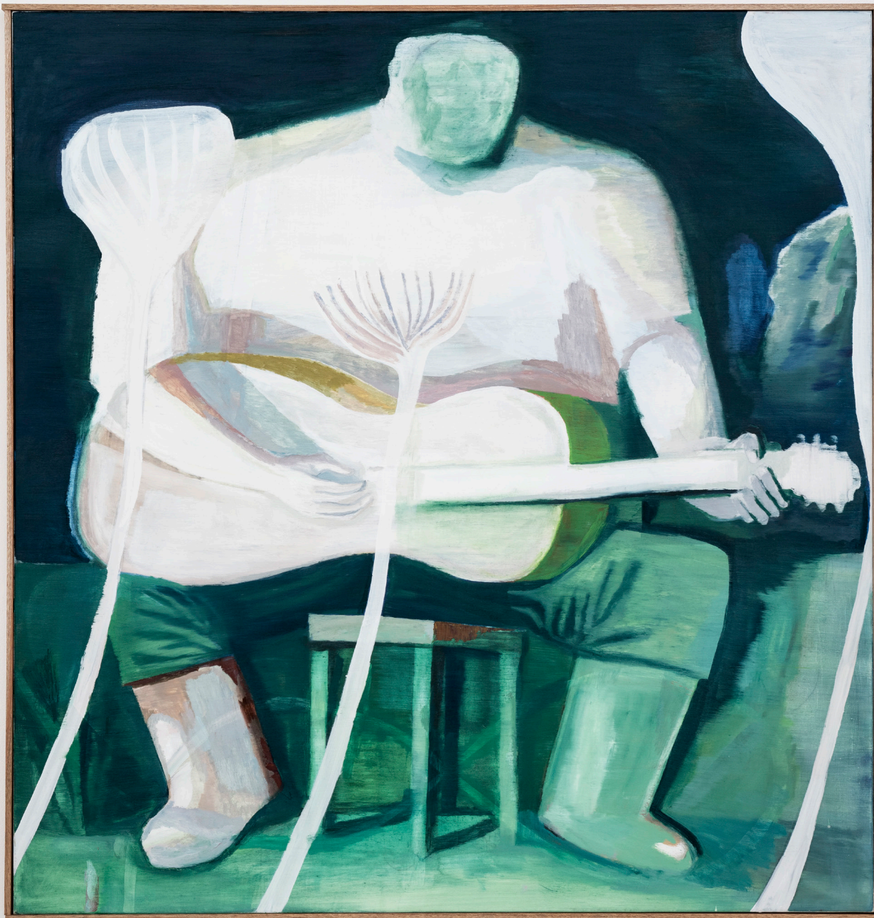
Swan Song , 2023 oil on canvas 122 x 112 cm £ 6,000