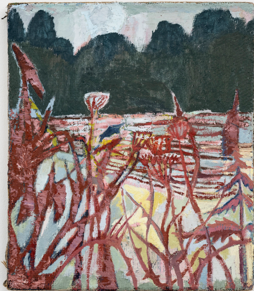
Cruel Nature , 2021 oil on canvas 120 x 90 cm £2,400