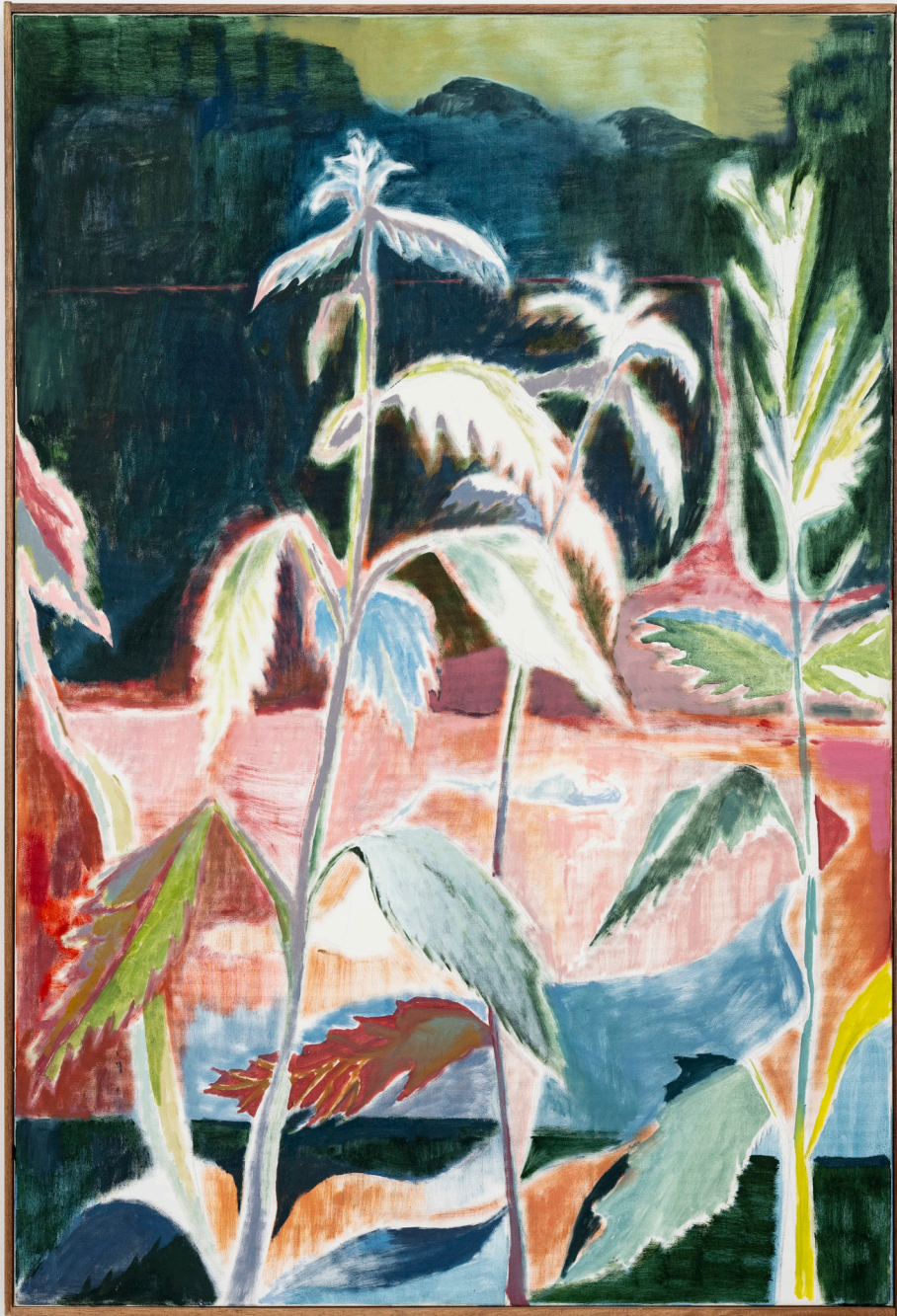
Nettles , 2021 oil on canvas 120 x 90 cm £ 4,500