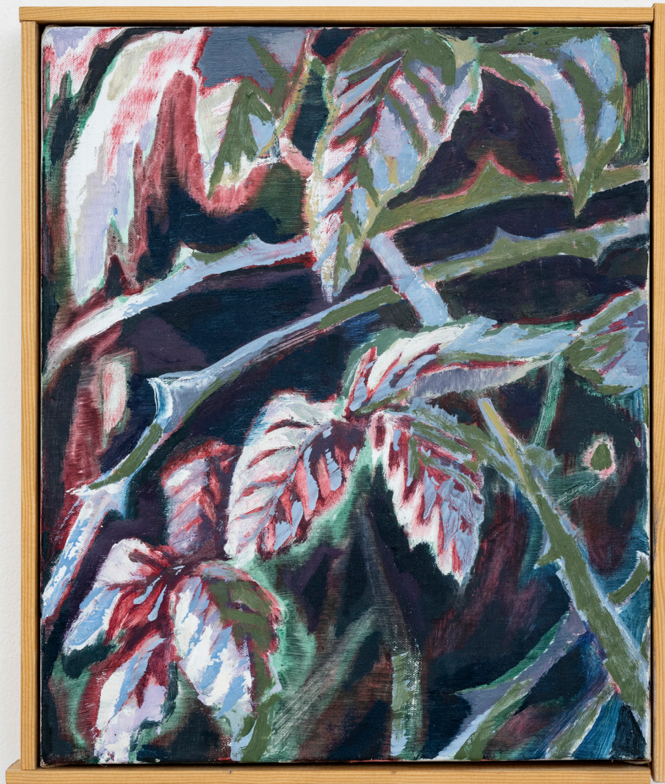
Brambles , 2023 oil on canvas 30 x 26 cm £1,400